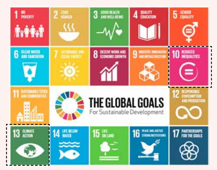
Global Goals for Sustainable Developmen

All these efforts on disentangling the understanding on who the climate migrants are, as well as on the complex nexus between climate change