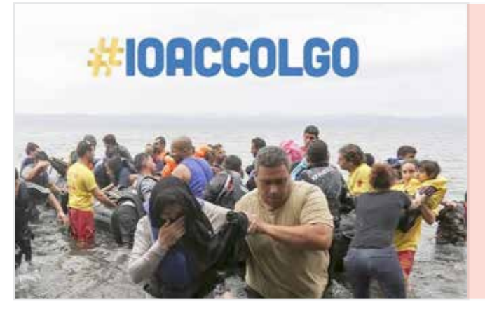
Ph. lo accolgo