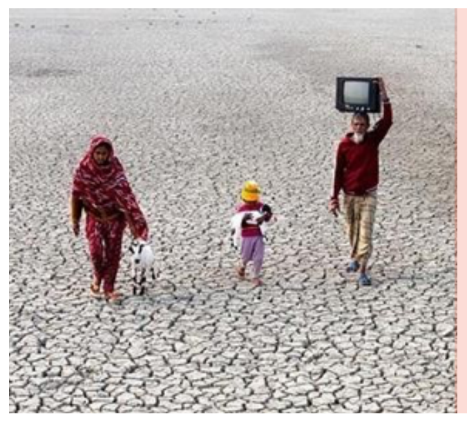
Ph. Climate migrants

The Global Compact on Migration<sup>4</sup>, issued in 2018, addresses under its objective n.2 the commitment of the International community to minimize the adverse drivers and structural factors that compel people to leave their country of origin such as, among others, those that may result from the adverse effects of climate change. Thus, the widely used (also by the IOM) definition of ' climate migrant ' could be considered more appropriate, considering that according to a brief paper elaborated by the European Parliamentary Research Service, the word 'migrant' may "suggest a degree of volition in the decision to move"<sup>5</sup>.