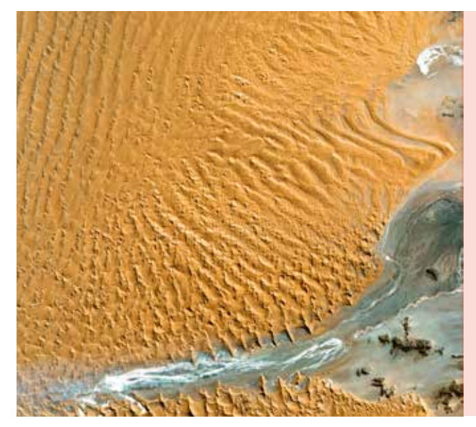
Namib-Naukluft National Park is an ecological preserve in Namibia's vast Namib Desert. Coastal winds create the tallest sand dunes in the world here, with some dunes reaching 980 feet (300

Migration to other countries occurs mainly in middle-income communities, while the low-income ones, due to their economic status, tend to move less without any chance to improve their living conditions.