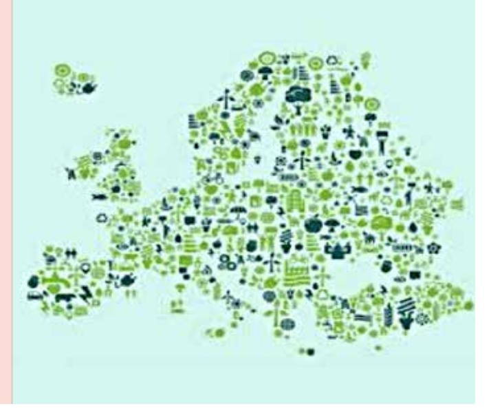
Ph. A new green deal in Europe

The importance of having stronger societies, leaving no one behind –in terms of wealth and security- could improve their recovery actions after a natural disaster. For example, as a recent report from the Center for climate and Energy Solutions<sup>25</sup> has outlined, after Hurricanes Katrina and Sandy, more affluent communities recovered and attempted to mitigate the problem in less time than the poorer ones.