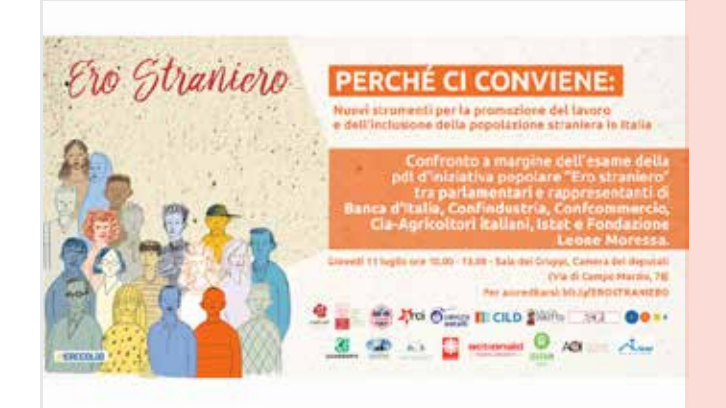
Ph. Ero straniero